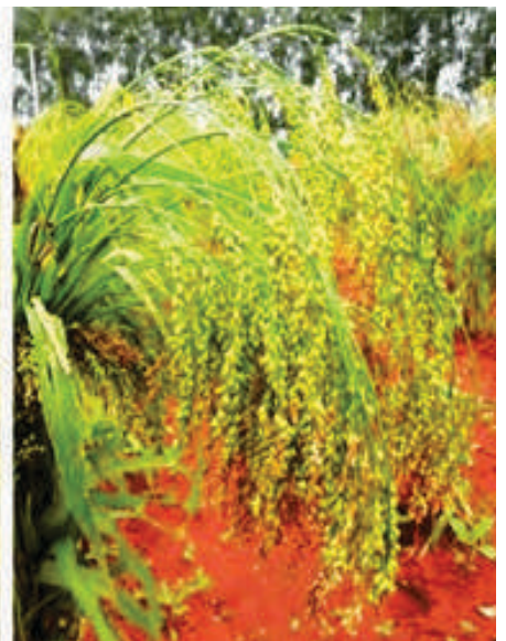
Porso Millet - Cheena