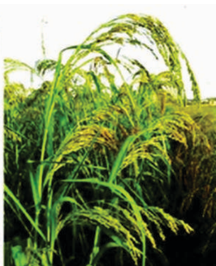
Little Millet – Kutki