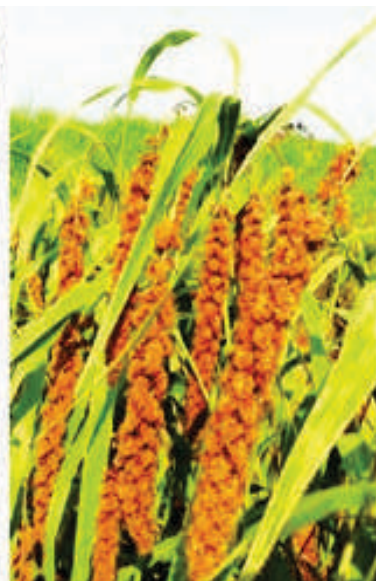
Foxtail Millet - Kangni