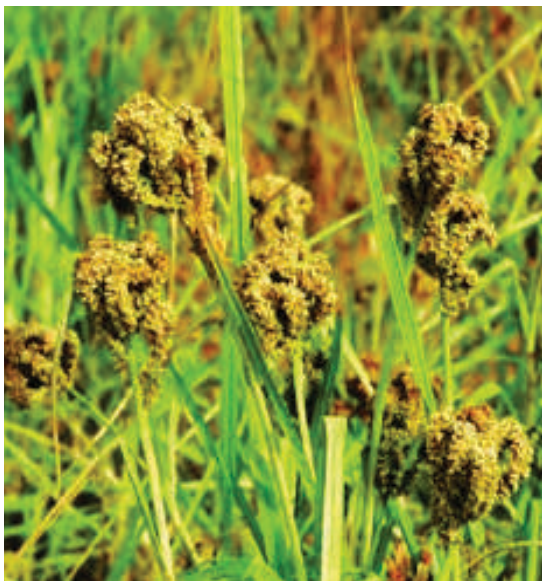
Finger Millet – Ragi

The millets have the potential to emerge as a potential alternative food, feed, and fodder crop as it is highly resilient towards high temperature and drought which makes it a climate-ready crop. The nutritional aspects of small millets in comparison to other cultivated crops like wheat and rice is very high. Finger millets have very high calcium (364 mg) when compared with wheat and rice while finger millet, porso millet and sorghum have high content of magnesium i.e., 146 mg, 153 mg and 133 mg respectively comparing to wheat flour (125 mg) and rice (19 mg). When iron content is compared, it is 4.6 mg in finger millet while 6.4 mg in pearl millet while it is 3.9 mg in wheat flour and 0.6 mg in rice.