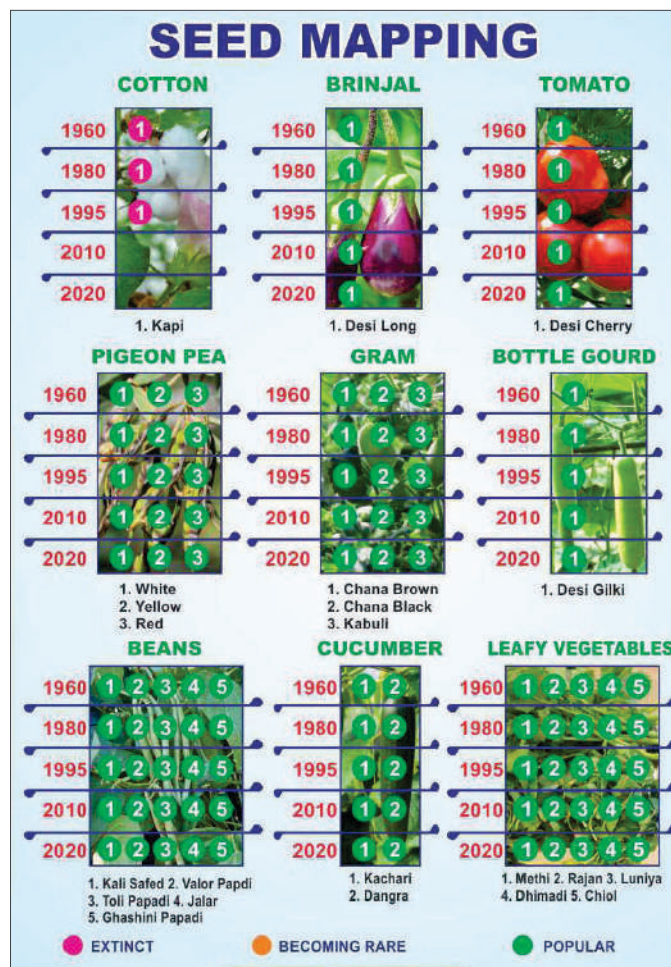
Photo: Mapping of Indigenous varieties of crops which have extinct or on the verge of extinction