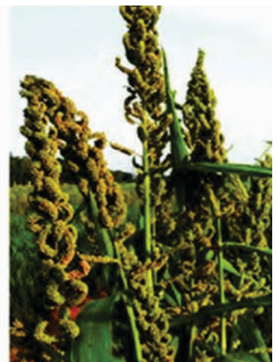
Barnyard Millet - Sama